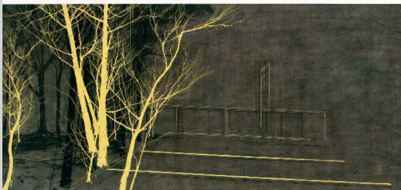
Carpark Overlap I, 2010. Oil on Panel, 144 x 87 cm