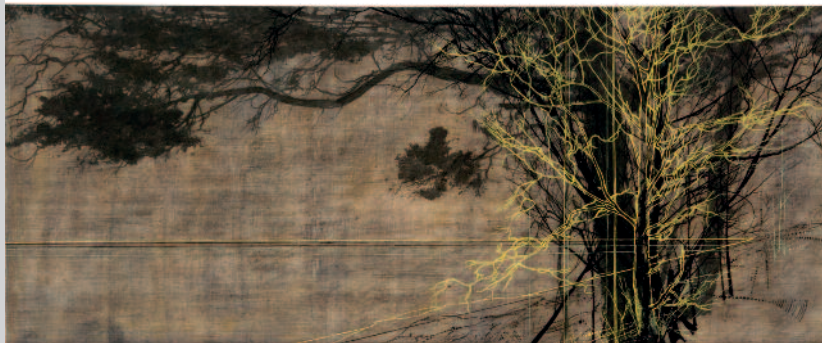
Reservoir I, Pale yellow, 2010. Oil on panel, 107 x 63 cm